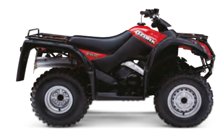
Flame Red (YT9)