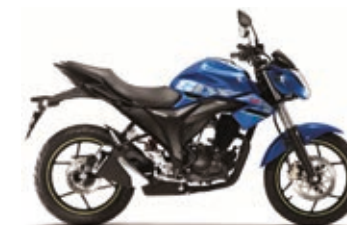
Metallic Triton Blue