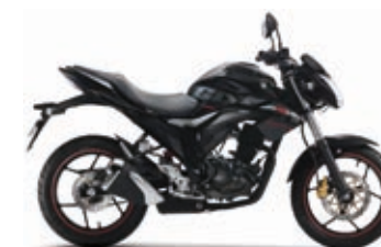
Glass Sparkle Black